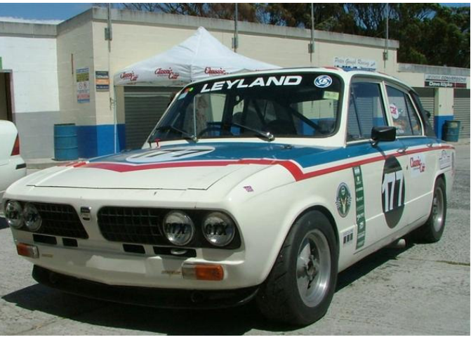
A racing Dolomite Sprint seen at the racing, unfortunately the motor had problems and due to a lack of spares will be going back to the UK